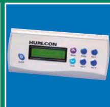
Genus IV Remote Control