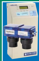
VX Salt Chlorinator