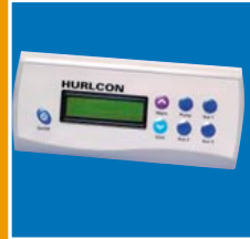
Genus IV Remote Control