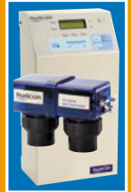
VX Salt Chlorinator