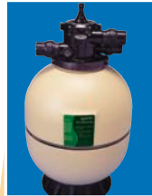
Multi Media Filter